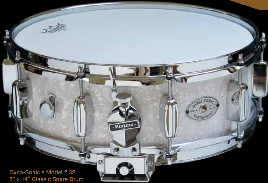
Dyna-Sonic • Model # 32 5" x 14" Classic Snare Drum

Rogers USA presents the reborn Dyna-Sonic. The snare drum that "changed the game" in the mid-20th century is back in this stunning, yet faithful tribute to the all-time classic. This ten-lug beauty is meticulously based on the design and styling of the rare, original wood shell snare model. Constructed of select North American hardwoods and finished in luscious White Marine Pearl with precision-cast, chromed hardware. At the heart of the drum is the Rogers proprietary, floating snare rail system, which provides extraordinary sensitivity and control that has never been matched. Beautifully appointed with the Rogers script logo, oval badge and clock face strainer, the new Rogers Dyna-Sonic stands as a masterpiece of art and sonic excellence. Two classic sizes available: