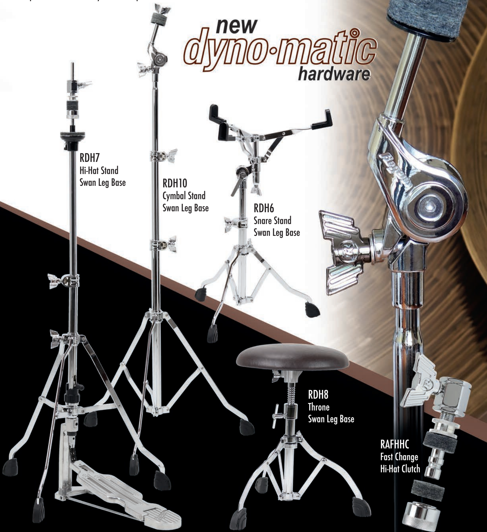
RAFHHHC Fast Change Hi-Hat Clutch