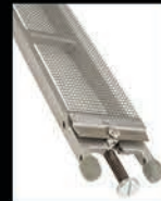
4466 Rail Snare Wires