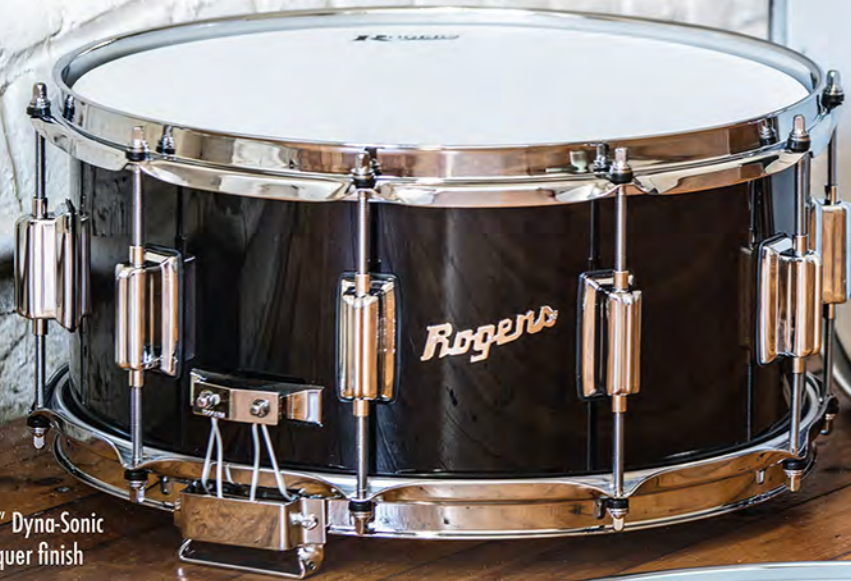
37BKL 6.5" x 14" Dyna-Sonic Black Lacquer finish

If you've never tried a Rogers Dyna-Sonic drum, you have yet to experience what lies beyond the limits of traditional snare drum design. This extraordinary instrument is the realization of a dream to build a totally live, touch-reactive snare drum... with the ability to voice every nuance of a player's personality.