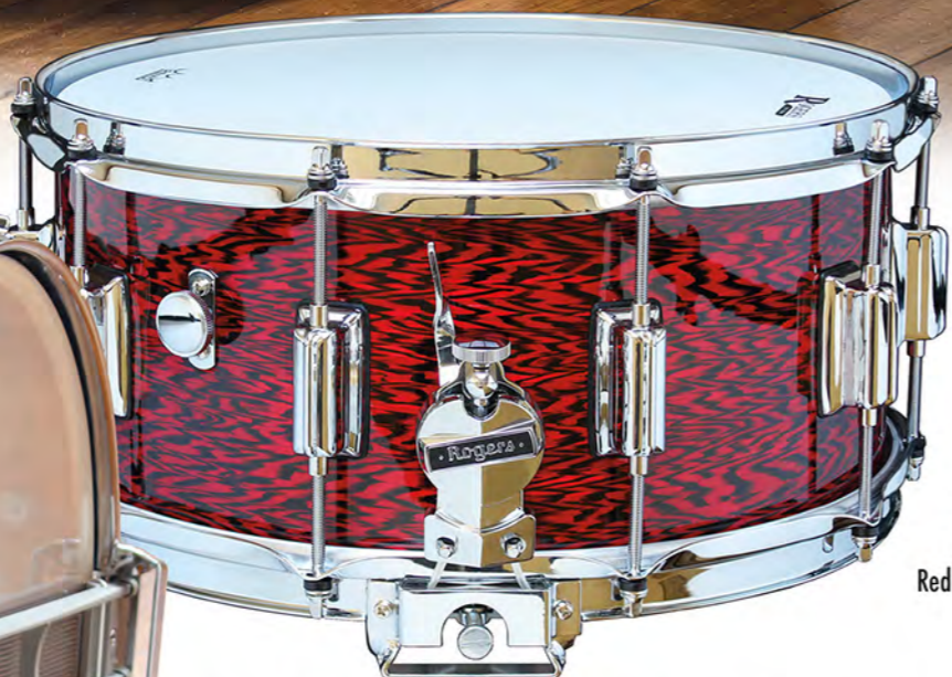
37RO 6.5" x 14" Dyna-Sonic Red Onyx finish

Featuring Rogers' famous floating snare rail system, the Dyna-Sonic is a masterwork in sonic design, painstakingly crafted to modern specs for build quality and consistency. Available in both 5" x 14" and 6.5" x 14" sizes. Featuring Rogers' own proprietary formula, 5-ply North American hardwood shells with reinforcement rings. Take your playing to the next level with pin-point responsiveness, feel and tone that you'll only get from a dual live-head snare drum.