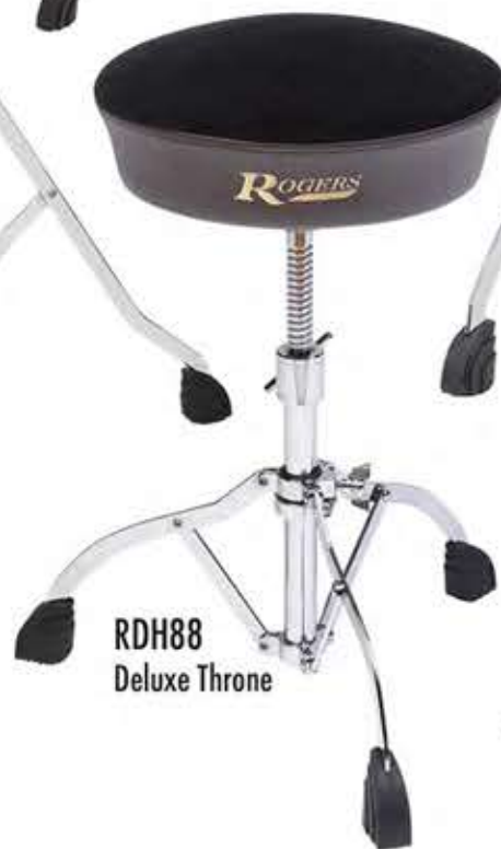
RDH88 Deluxe Throne