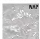
White Marine Pearl