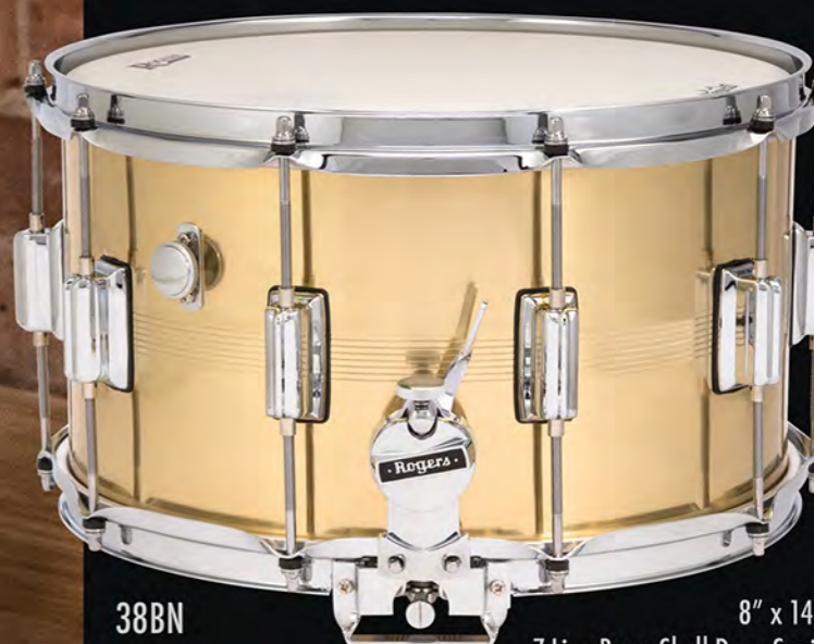
38BN 8" x 14" 7-Line Brass Shell Dyna-Sonic