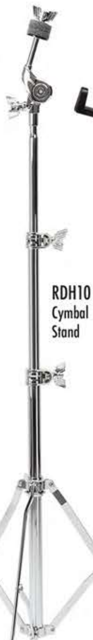
RDH10 Cymbal Stand