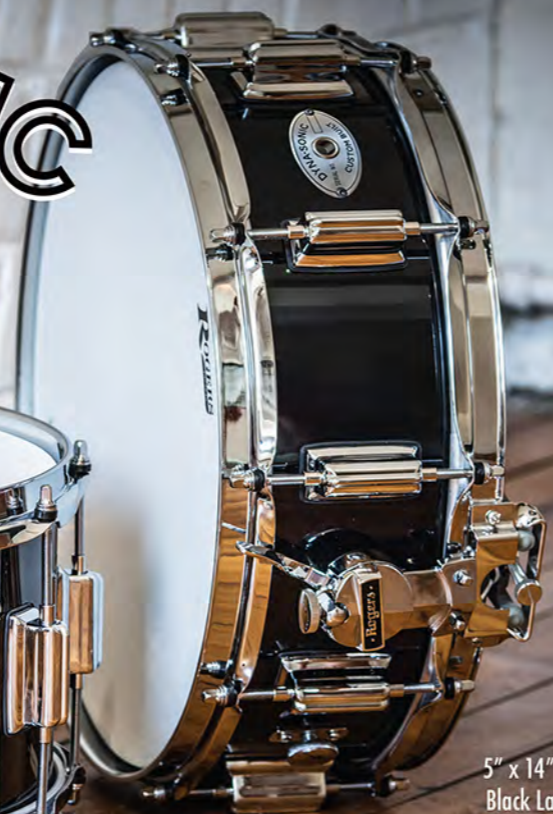
36BKL 5" x 14" Dyna-Sonic Black Lacquer finish