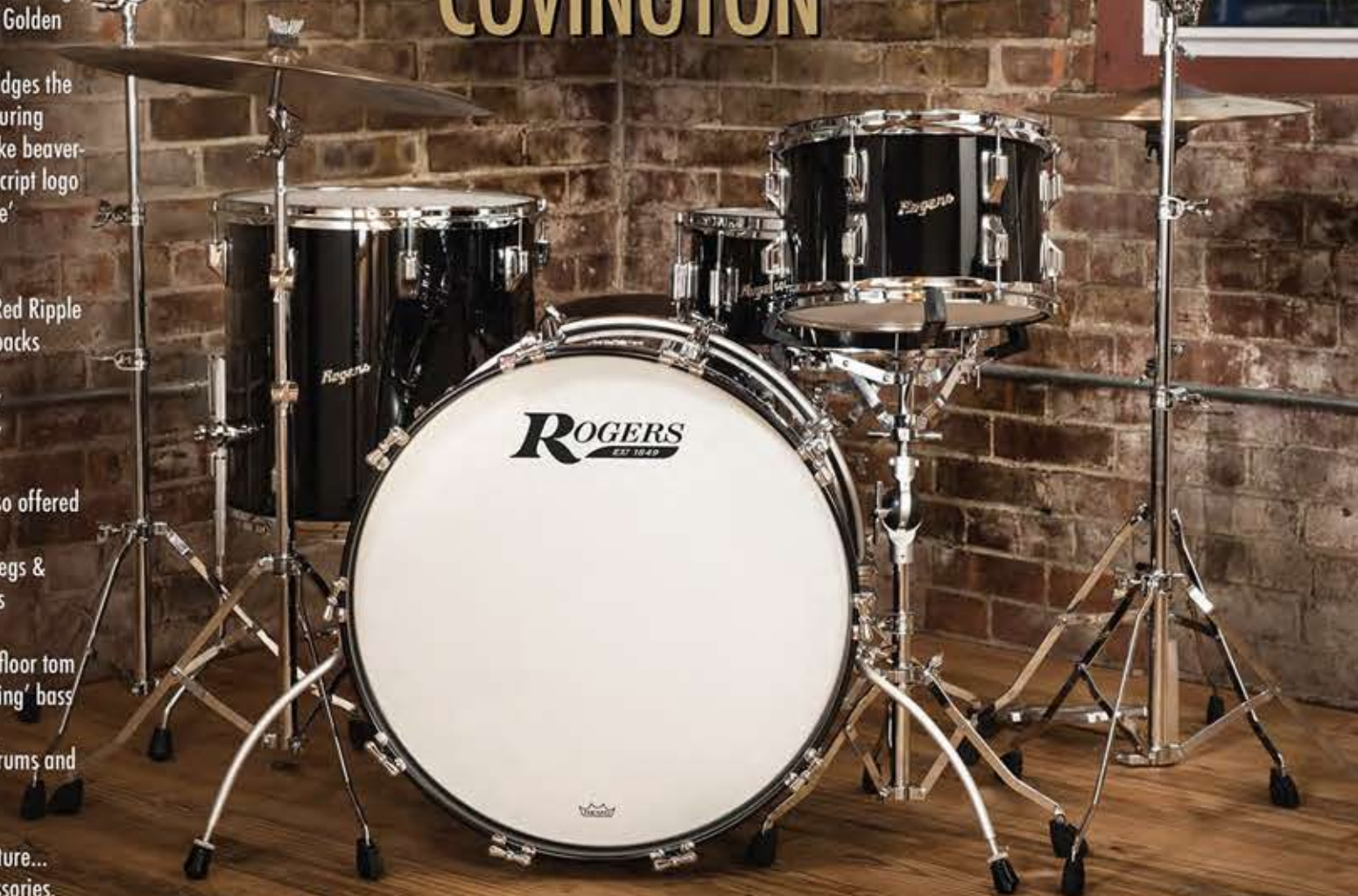
CV-0322ALN-BLK Covington 3pc Kit Black Lacquer Finish