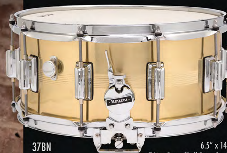
37BN 6.5" x 14" 7-Line Brass Shell Dyna-Sonic