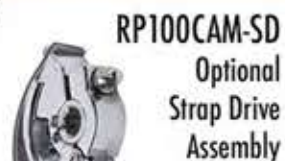
RP100CAM-SD Optional Strap Drive Assembly