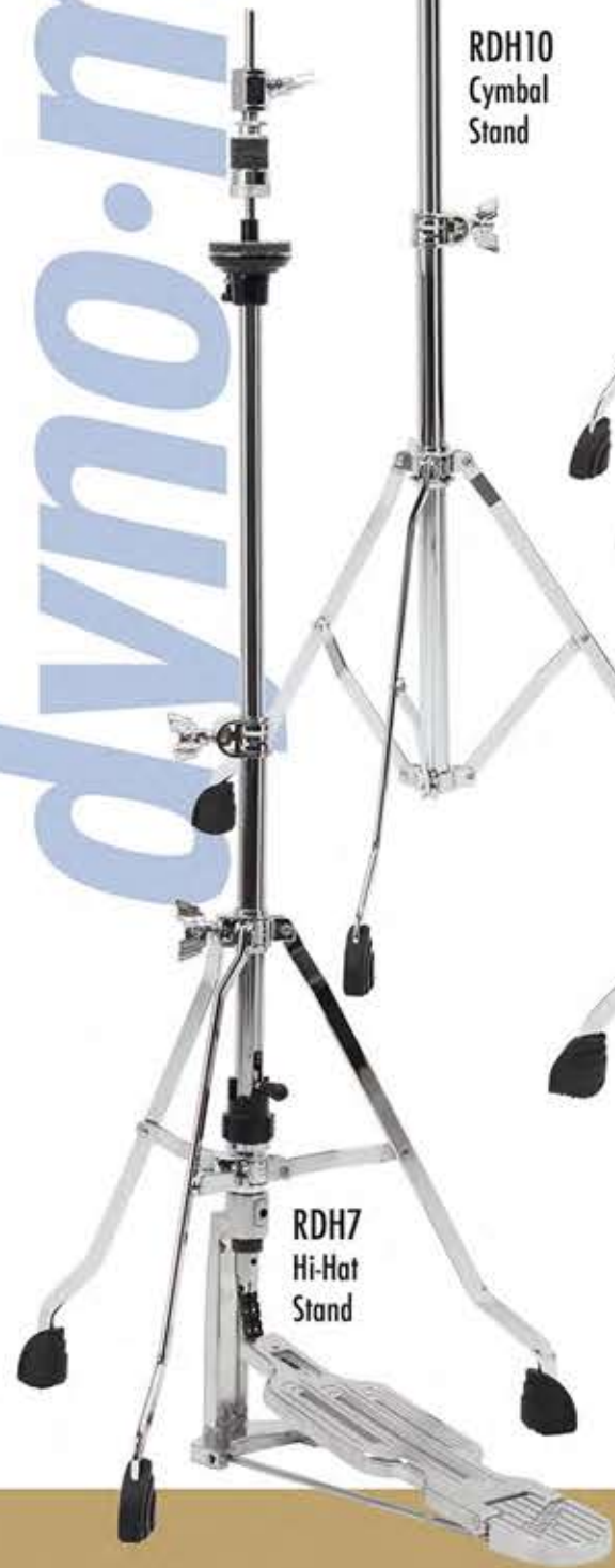
RDH7 Hi-Hat Stand