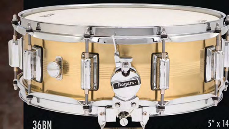
36BN 5" x 14" 7-Line Brass Shell Dyna-Sonic