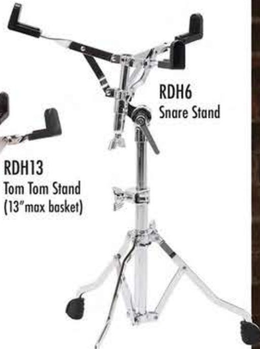
RDH6 Snare Stand