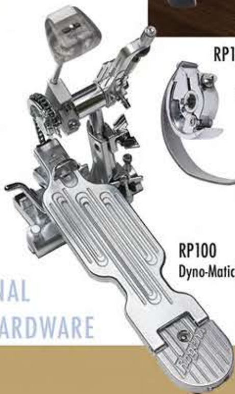
RP100 Dyno-Matic Pedal