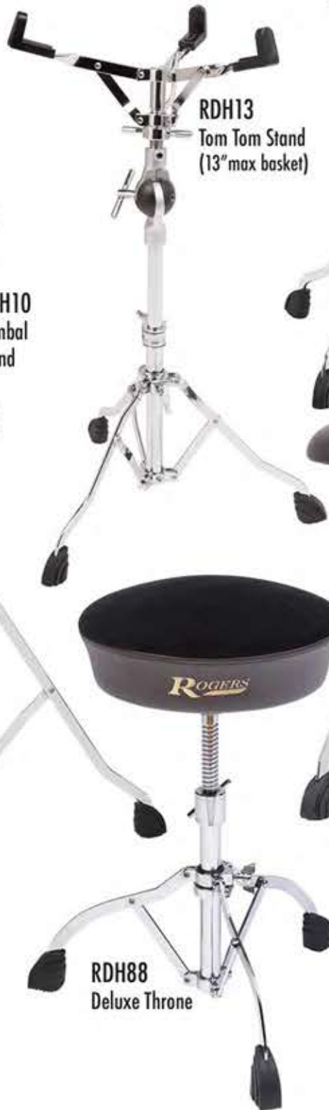
RDH13 Tom Tom Stand (13" max basket)